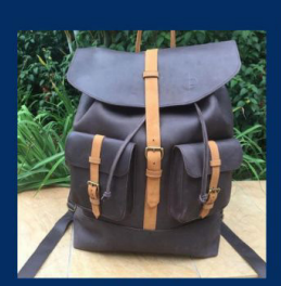
Safari mini bag. Comes in a variety of colours