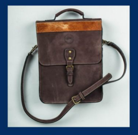
Yala man bag bag Available in a variety of colours. Comes with a long strap.